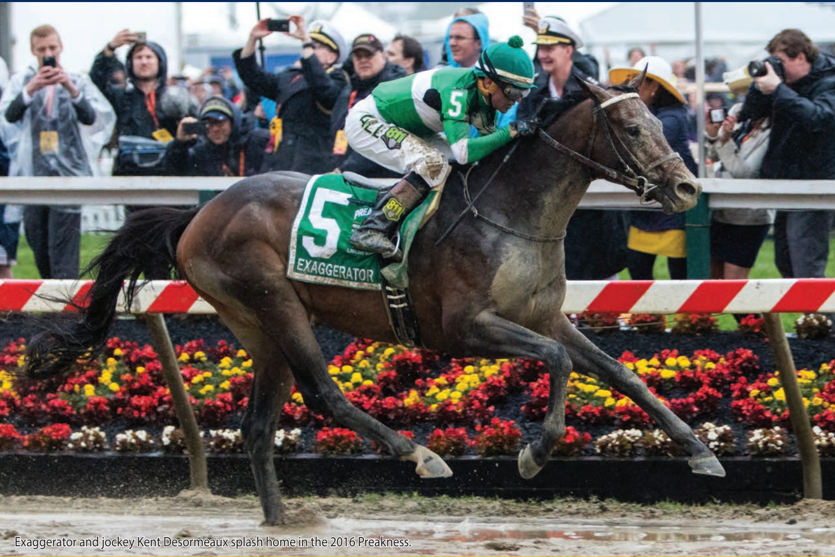
Exaggerator and jockey Kent Desormeaux splash home in the 2016 Preakness.